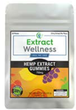
750MG / 15 OZ BAG (25mg ea / 30 pcs)